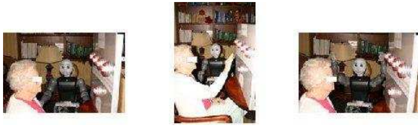
Fig. 3: Human-robot interacting during the music game : the robot gives hints related to the music game, the user answers, and the robot congratulates and applauds the correct answer