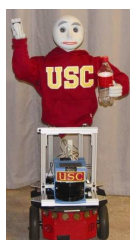
Fig. 1: Robot test-bed : Bandit II humanoid torso mounted on the Pioneer mobile base

social disorders (e.g., autism [9]) constitute another growing population that could benefit from assistive robotics in the context of special education, therapy, and training.